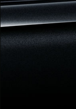
□ Black Sapphire metallic