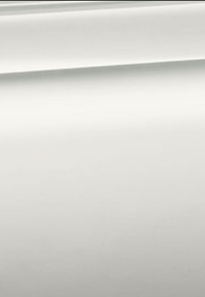
■ Alpine White non-metallic