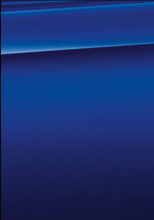
□ San Marino Blue metallic