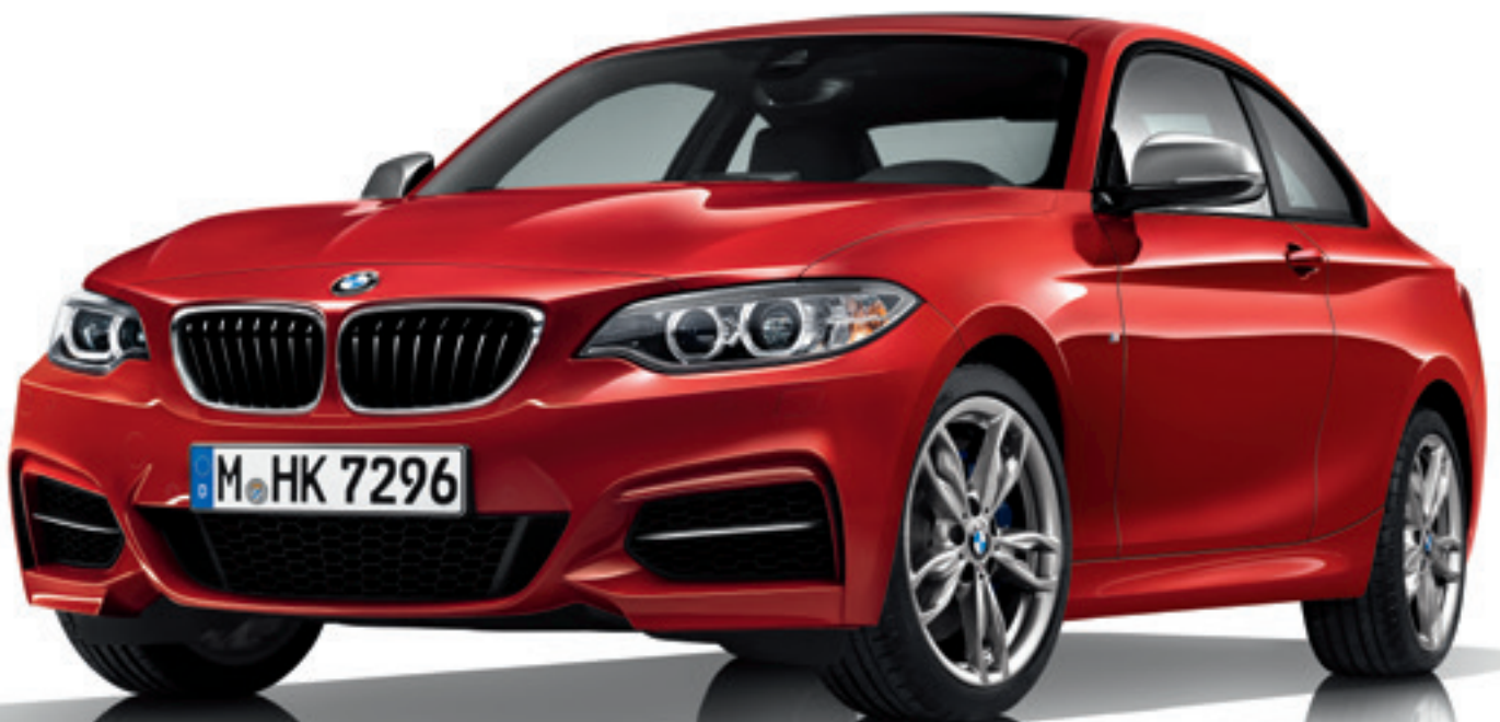
BMW 2 Series Coupé M240i model shown above.