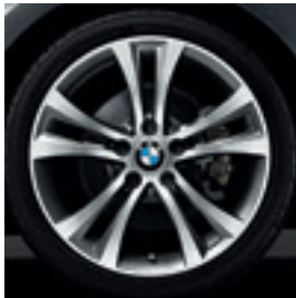
18" Y-spoke style 384