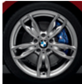
18" M Double-spoke style 436 M