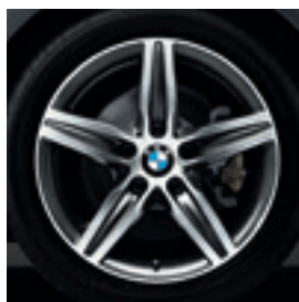
17" Star-spoke style 379