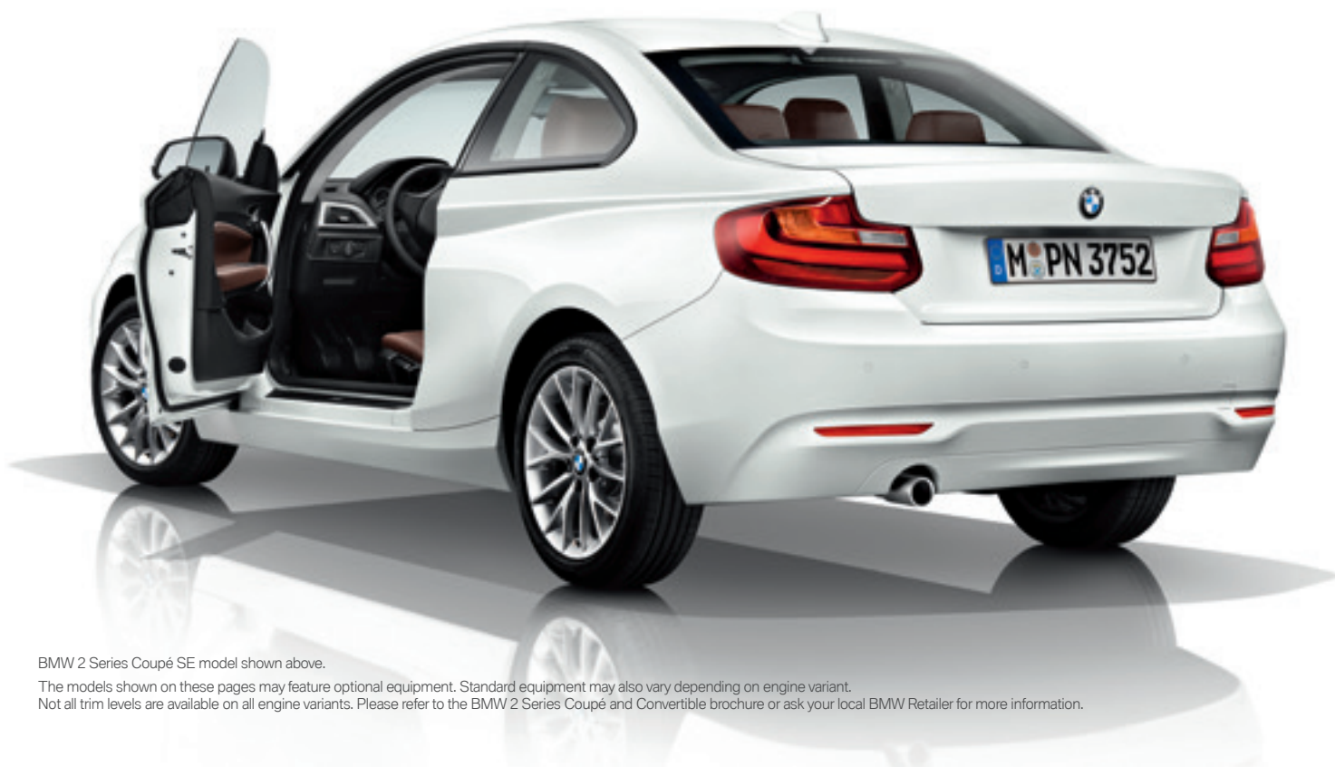
BMW 2 Series Coupé SE model shown above.

The models shown on these pages may feature optional equipment. Standard equipment may also vary depending on engine variant. Not all trim levels are available on all engine variants. Please refer to the BMW 2 Series Coupé and Convertible brochure or ask your local BMW Retailer for more information.