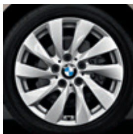
17" Turbine-spoke style 381