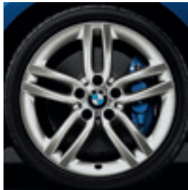
18" M Double-spoke style 461 M