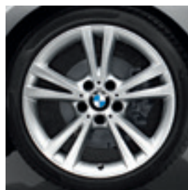
18" Double-spoke style 385