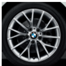
17" Y-spoke style 380