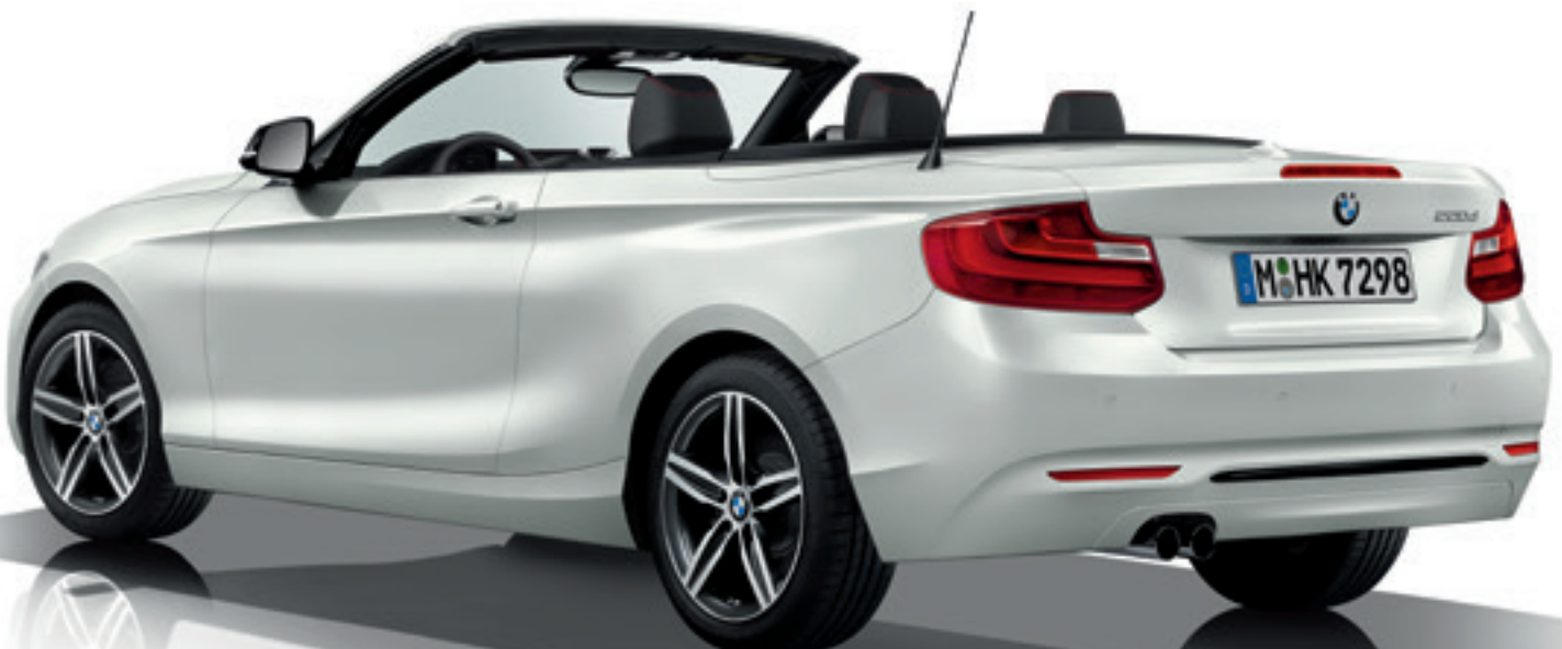
BMW 2 Series Convertible Sport model shown above.

RRP from £26,820 inc. VAT + £1,000 over SE