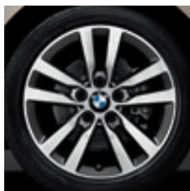
17" Double-spoke style 655